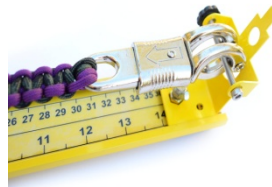
Threaded rod and nut can be used for various hooks, snaps, and accessories.